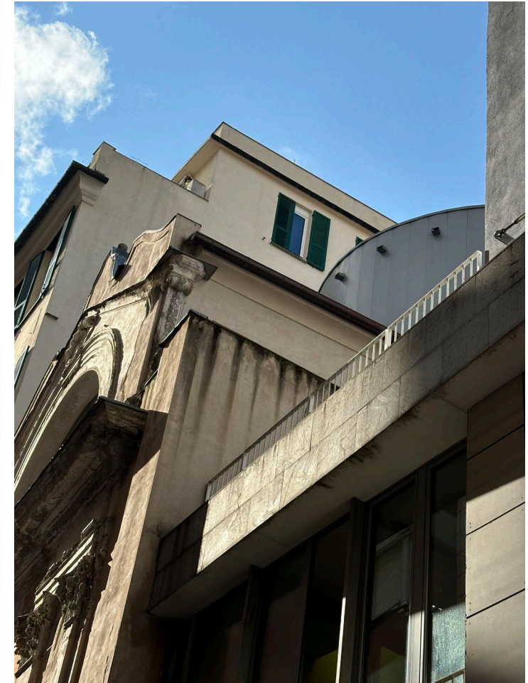
Ex oratorio next to the Garaventa School