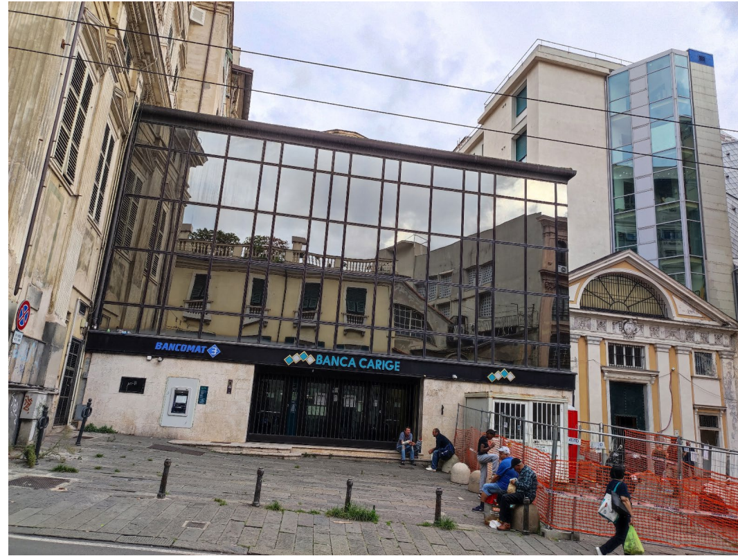
Architectural and urban hybridity