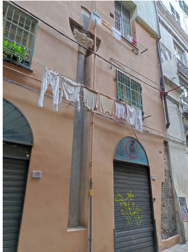
Vico di Scurreria la Vecchia