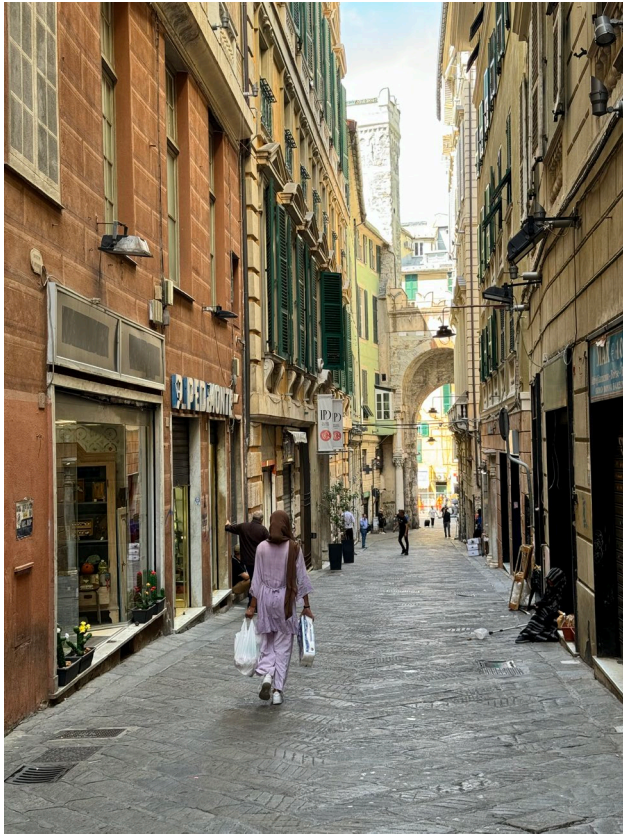
Via del Campo

Does people-centered conservation therefore mean that we should ask people before initiating intervention?