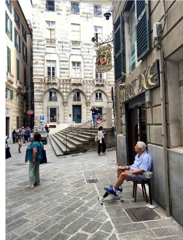
Piazza San Matteo